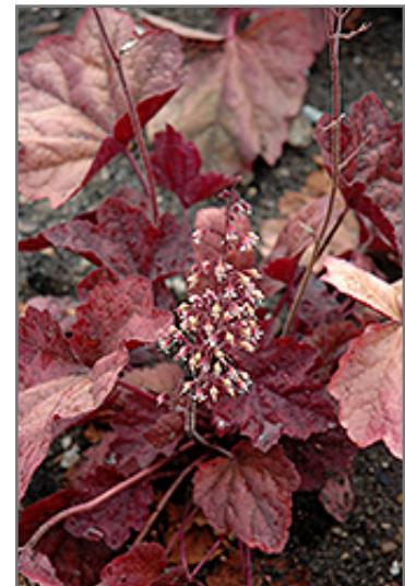
Lava Lamp Coral Bells flowers