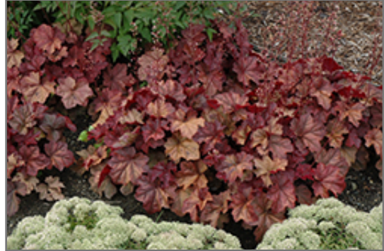
Lava Lamp Coral Bells

Lava Lamp Coral Bells is a fine choice for the garden, but it is also a good selection for planting in outdoor pots and containers. With its upright habit of growth, it is best suited for use as a 'thriller' in the 'spiller-thriller-filler' container combination; plant it near the center of the pot, surrounded by smaller plants and those that spill over the edges. Note that when growing plants in outdoor containers and baskets, they may require more frequent waterings than they would in the yard or garden. Be aware that in our climate, most plants cannot be expected to survive the winter if left in containers outdoors, and this plant is no exception. Contact our experts for more information on how to protect it over the winter months.