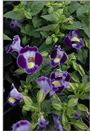
Catalina Midnight Blue Torenia flowers

Catalina Midnight Blue Torenia is recommended for the following landscape applications;